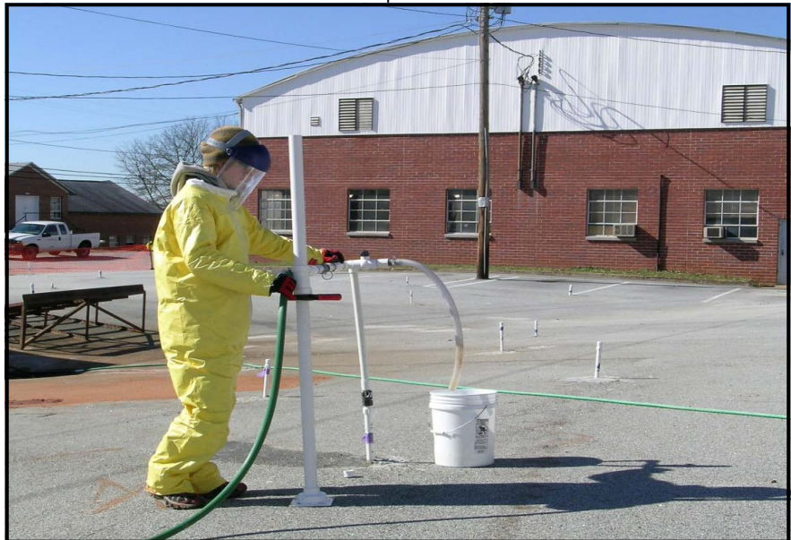
Project cleanup at the Griffin Campus around the future Student Learning Center.

Call: 706-369-5706 for more info or 706-542-5801.